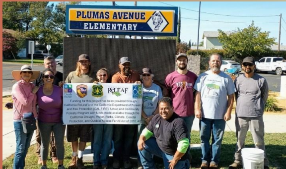
Group photo after planting 30 trees. Another good day.

We planted eight more maple trees at the Dunstone Garden. Seven of the trees are memorial trees planted for one family.