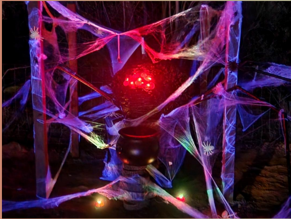
Giant, creepy spider. She felt very at home at our Eye Spy Insect event

WOW! The Halloween Eye Spy Insect event was a great success! Over 100 kids and parents attended. Lots of candy, hotdogs and popcorn were given out.