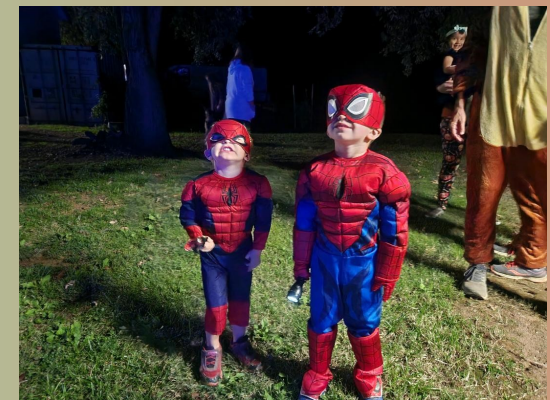
We felt very well protected that night!