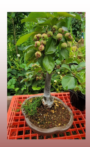
Crab Apple Tree