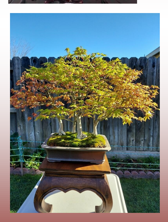
Maple Tree Forest