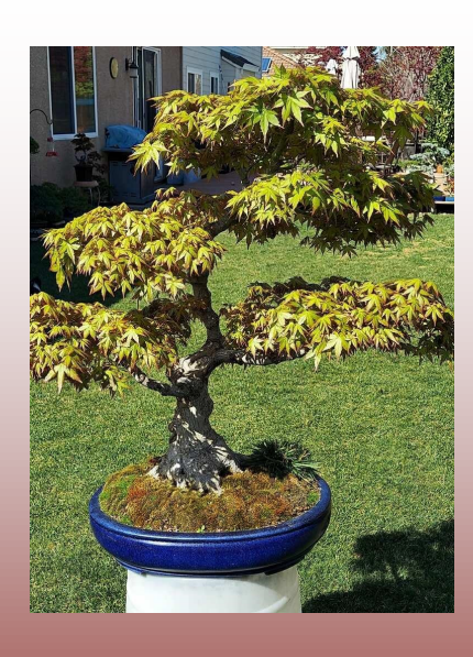
Old Maple Tree